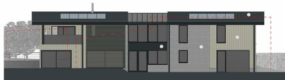
AS PROPOSED - EAST ELEVATION 1:100