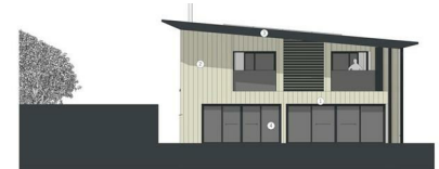
AS PROPOSED - SOUTH ELEVATION 1:100