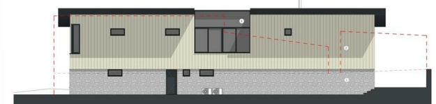
AS PROPOSED - WEST ELEVATION 1:100